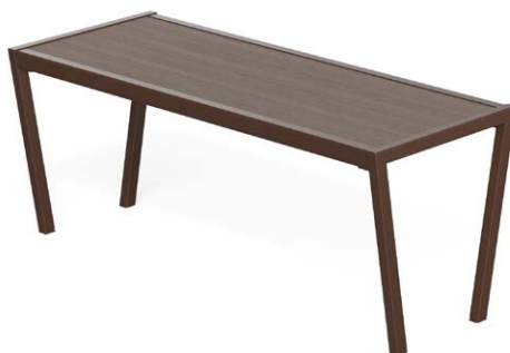
Table consisting of two 50x40x2 mm tubular steel supports and top with 4 mm thick folded steel sheet frame and WPC slats. All metal parts are galvanised and coated with thermosetting polyester powder. All fixings are in AISI304 stainless steel. Prepared for ground fixing through M10 threaded bars to cement (included).